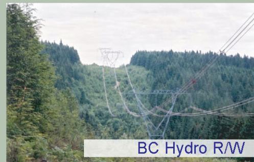
BC Hydro R/W