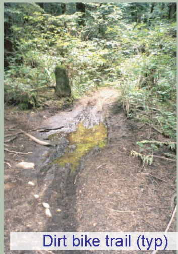
Dirt bike trail (typ)